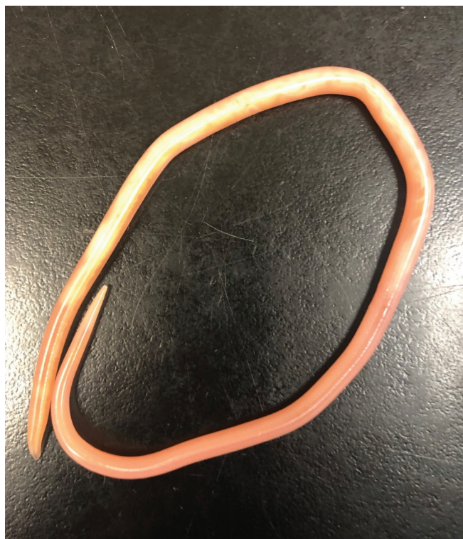
Figure 3: An Ascaris lumbricoides worm vomited by a 5-year-old boy.

While in hospital, the patient had a karyotype test, which confirmed a diagnosis of trisomy 21. He had health supervision screening for trisomy 21, which identified primary hypothyroidism, and he was started on levothyroxine. He was also noted to have developmental delay, for which he was referred to local developmental services. He received the remainder of his Caring for Kids New to Canada 1 pediatric screening and care. This process identified incomplete immunizations, hearing loss and dental caries that required extractions. Before discharge, the care team arranged follow-up for the patient with a community pediatrician.