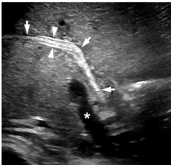
Figure 2: Abdominal ultrasound of a 5-year-old boy with biliary ascariasis, taken in an oblique sagittal plane through the right hepatic duct and liver porta after start of treatment. A worm is seen in the common and right hepatic ducts (arrows). The parallel walls of the right hepatic duct are prominent (arrowheads) where they are at right angles to the ultrasound beam. *Main portal vein.

pass worms per rectum and did not have further emesis during this course of therapy. We considered endoscopic retrograde cholangiopancreatography (ERCP) to remove the Ascaris directly, but medical therapy was preferred owing to the patient's clinical stability and the technical challenges of performing ERCP in a young child.