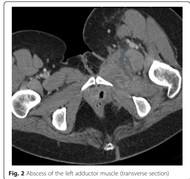
Fig. 2 Abscess of the left adductor muscle (transverse section)

The guided puncture cultures as well as the blood cultures were positive for methicillin-sensitive Staphylococcus