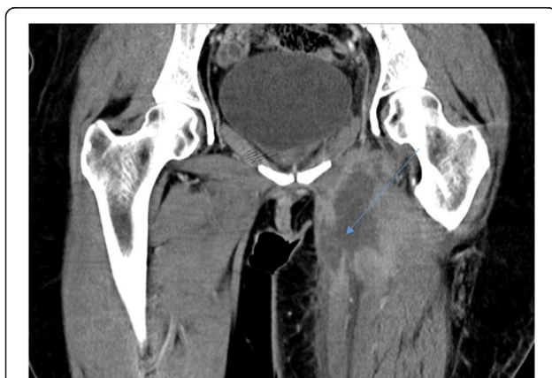
Fig. 1 Abscess of the left adductor muscle (sagittal section)

No vaginal discharge, pain, or fever was reported; the antibiotic therapy was given for a total duration of 2.5 months.