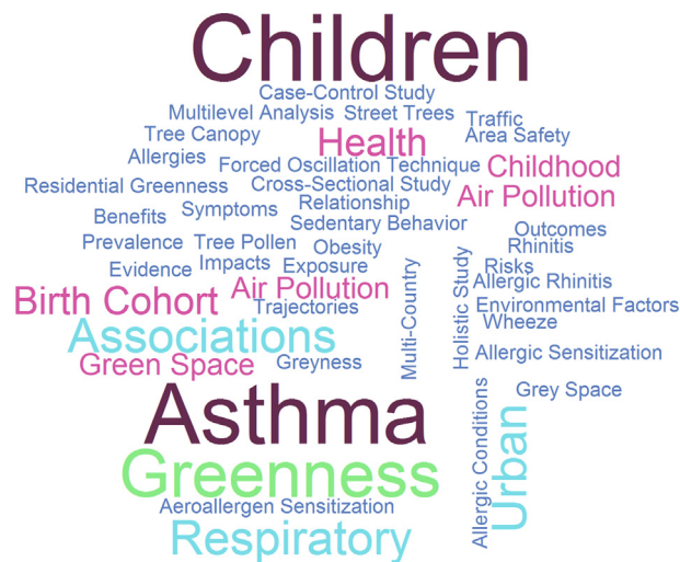
Fig. 2 Word cloud of the most common title words.

Word cloud from title of selected articles was produced using the statistical software R (3.5). All words were transformed to lower case; plural were transformed to singular. Common words (e.g. prepositions, transition words) and numbers were removed. The size of the words was scaled