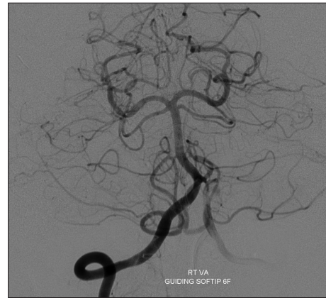
Fig. 5. Post-revascularization transfemoral cerebral angiography after posterior inferior cerebellar artery (PICA) to PICA anastomosis shows the good patency of both PICA from right vertebral artery (VA) and still shows Lt. VA-PICA dissecting aneurysm.

was opened. After temporary clipping of proximal and distal PICA and perforating artery, a curved incision rather than a straight one along the PICA was done. To do this, the distal end of both PICA was stay-sutured. This was followed by the continuous suture from outside to inside of inner side of the vessel.