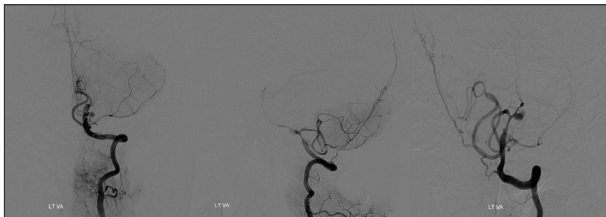
Fig. 2. On day 10, complex vertebral dissecting aneurysm of long segment includes posterior inferior cerebellar artery origin by transfemoral cerebral angiography (AP, Lateral, Oblique view).