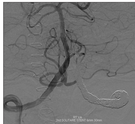
Fig. 6. Post endovascular segmental occlusion using coil with stent shows total occlusion of vertebral artery dissecting aneurysm and both posterior inferior cerebellar artery was patent.

Then, the final suture was done from inside to outside of the vessel. Following this, the proximal end was also stay-sutured on the external side and then tied with the final inner suture. Moreover, the continuous suture of outer side from outside to inside of the vessel was done in the same manner. After removal of temporary clips, a good patency was also seen on intraoperative indocyanine green angiography (Fig. 4).