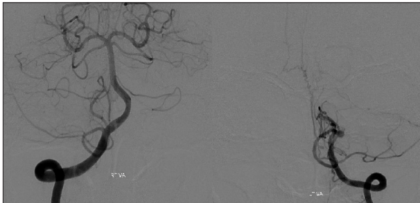
Fig. 3. Tonsilomedullary and telovelotonsilar segments of the right posterior inferior cerebellar artery (PICA) shows parallel course compared with contralateral same segments of PICA.