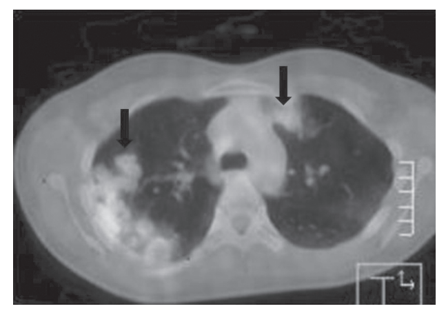
Fig. 2. FDG-PET CT showed increased FDG uptake (max SUV: 3.1) (arrows).

orrhagic infarcts as in a case of hemorrhagic metastasis or other benign conditions (Fig. 1B). FDG-PET CT was performed to find out a possible primary site of malignancy. However, it revealed no remarkable abnormal finding except an increased FDG uptake (max SUV: 3.1) in the lung lesions (Fig. 2). Bronchoscopic and cytological examination of the sputum showed nothing of particular significance. We could not observe parasite eggs in stool, sputum, or bronchoalvelolar lavage (BAL) fluid. However, ELISA (Genedia Ab ELISA, Green Cross MS, Yongin, Korea) was positive for antibodies against P. wester mani . She received praziquantel therapy (25 mg/kg, 3 times a day for 2 days). At a week after the medication, the patient's