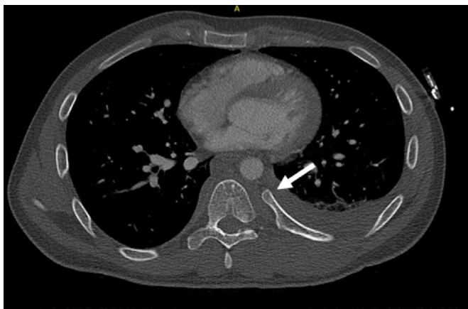
Figure 2 Transverse CT-scan made during the initial trauma assessment. The arrow shows the costovertebral dislocation of the left seventh rib.

Due to fact that the patient kept exhibiting motor restlessness a brain CT was repeated 1 day after the initial trauma assessment which showed no intracranial bleeding or fractures of the skull.