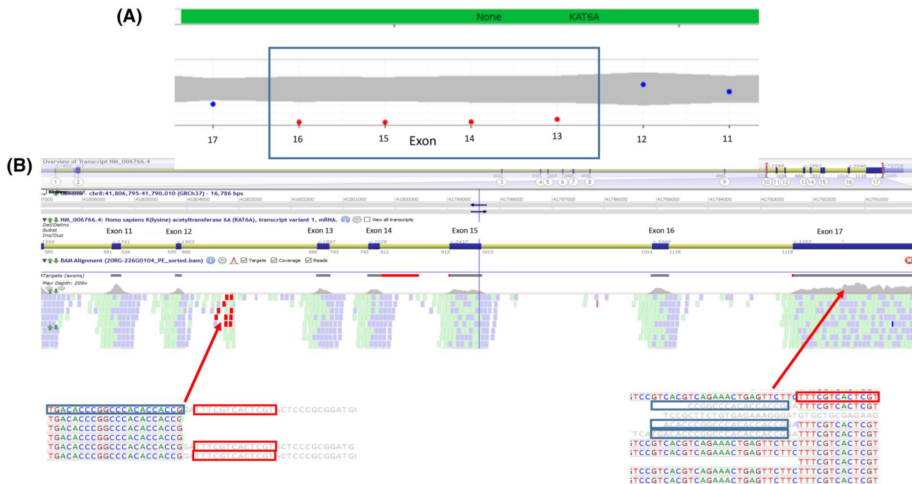
FIGURE 2 KAT6A exon 13–17 deletion detected in C14. (A) Results from our CNV analysis tool indicating a deletion of exons 13–16 of the KAT6A gene. The blue dot represents normal copy number and red dot a deletion. The grey area shows the variance in read depth for the other samples on the run. (B) The sequencing reads at the identified breakpoints. The blue box shows the matching reference sequence from intron 13 that can be seen in the reads mapping to exon 17 with an insertion of GA in between. The red box indicates the matching reference sequence from exon 17 seen in intron 12, again with an insertion of GA. The CNV analysis results did not indicate a deletion of exon 17 however the results were out of the normal range. This is consistent with the breakpoint being within the exon and with it not being called due to the size of the exon. CNV, copy number variant; GA, gestational age [Colour figure can be viewed at wileyonlinelibrary.com ]

percentage of cases posing challenges shows that it is a complex service to run and clearly requires multidisciplinary team working, especially when working with the time pressures required for rapid delivery of results to inform pregnancy management.