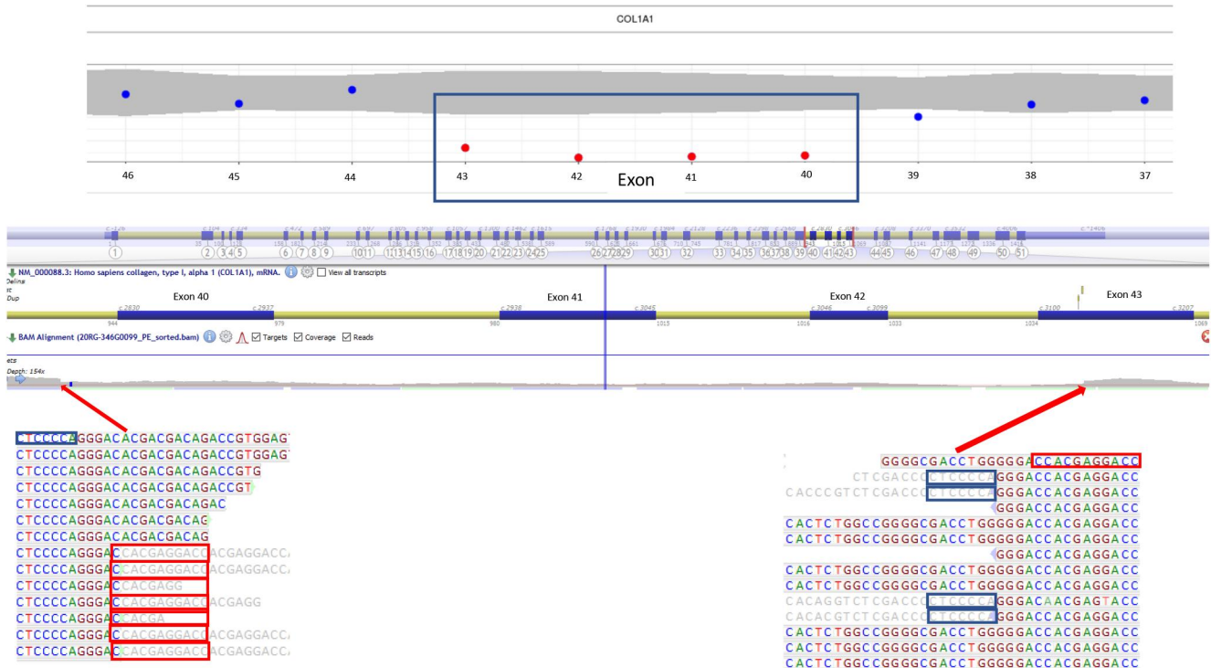
FIGURE 3 COL1A1 exon 40–43 deletion detected in C15. (A) Results from our CNV analysis tool indicating a deletion of exons 40–43 of the COL1A1 gene. The blue dot represents normal copy number and red dot a deletion. The grey area shows the variance in read depth for the other samples on the run. (B) The sequencing reads at the identified breakpoints. The blue box shows the matching reference sequence from intron 39 that can be seen in the reads mapping to exon 43 with insertion of GGGG from the exon 43 sequence in between. The red box indicates the matching reference sequence from exon 43 seen in intron 39, again with an insertion of GGGG. CNV, copy number variant [Colour figure can be viewed at wileyonlinelibrary.com ]

pipeline. Although in this case the use of inheritance filtering would not have changed the outcome, it highlights an important consideration for mosaicism and the need for manual inspection of parental sequencing reads for all “ de novo ” cases, as recurrence risks in this case are now high, as compared to a germline mosaicism risk. In our second case (C10), the fetus had a lethal phenotype and the mother was subsequently diagnosed with mild features when examined by a clinical geneticist when returning the ES results. Asymptomatic parents may be a somatic mosaic for a pathogenic variant with a variant allele frequency (VAF) high enough to be called by a variant caller, but these variants may then be filtered out if the inheritance does not fit that expected based on the family history and clinical information available. In the prenatal setting this is especially important to consider for conditions such as osteogenesis imperfecta, which often presents prenatally and for which mosaicism 20,21 and variable expressivity 22,23 are common and have been reported previously. 4,24 It is therefore crucial that mosaicism is considered when designing pipelines and cut-offs for VAFs, although this will highly depend on the quality of the sequence data and will often not be straight forward.