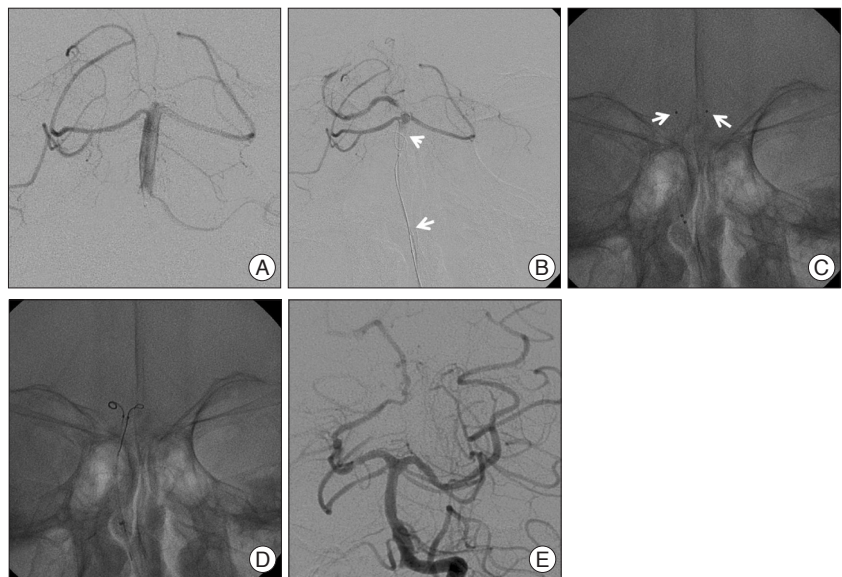
Fig. 2. A : Selective angiogram showing occlusion at BT and bilateral PCAs. B : Angiogram obtained during thrombolysis with the double device technique (arrowhead : wire, white arrow : microcatheter) showing occlusion at the proximal portion of the right PCA and left PCA. C : Two microcatheters (white arrow) were placed at proximal portions of different PCAs. D : Thrombolysis was performed by the double device technique with coils at bilateral PCAs. E : Final angiogram showing complete recanalization. BT : basilar tip, PCAs : posterior cerebral arteries.

For treatment of acute stroke cases, a variety of IAT techniques