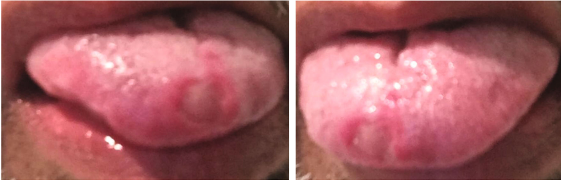
FIGURE 1: Ulcerative lesion with red halo on the dorsum surface of the right side of the tip of the tongue.