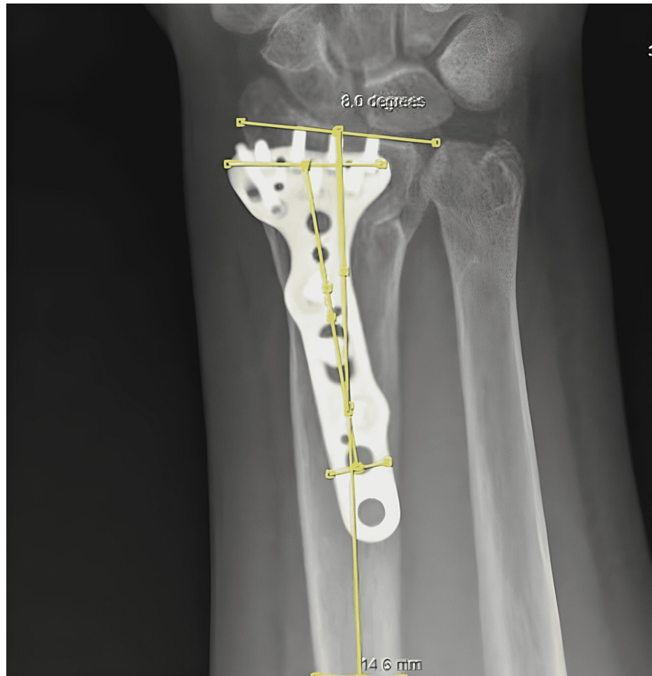
FIGURE 1: Coronal malposition measurement