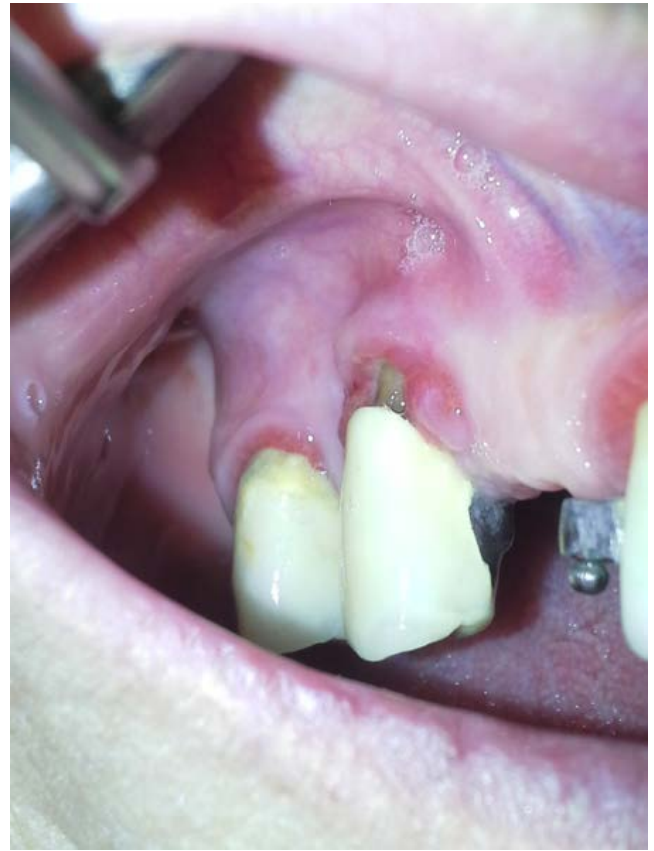
Figure 6. 4-month follow-up: reduction of the involved teeth mobility and a minor recurrence in gingival inflammation.

often covered by fibrin and is ulcerated and friable due to masticatory trauma. 7,8 Depending on the age of the lesion, the color of the surface ranges from pink to red or purple. Young PGs have higher vascularity and hyperplastic granulation tissue, while older PGs have more collagen. 8