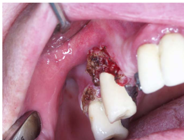
Figure 3. After total excision of the lesion with diode laser.