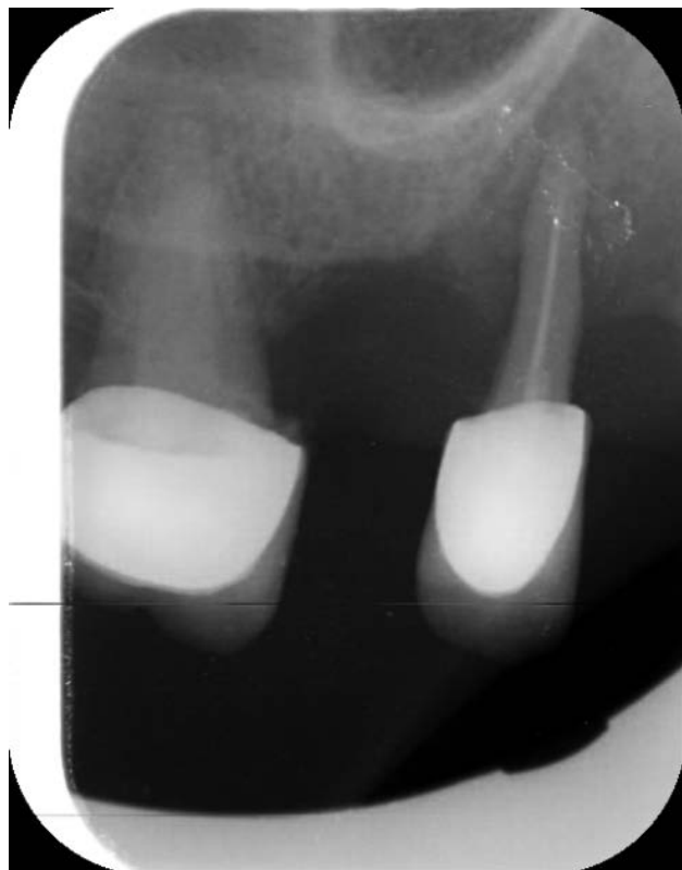
Figure 2. Periapical radiograph shows no osseous involvement.