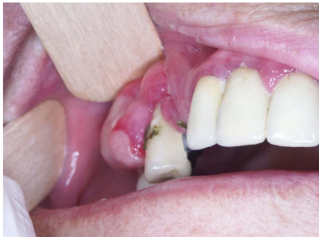
Figure 1. A solid and lobulated pinkish mass with a diameter more than 2 cm is associated with local ulceration on marginal, buccal gingiva of maxillary right molar. The relevant teeth (#14 and #16) are covered by metal-ceramic crowns for partial denture with irregular margins. Circumferential dental calculus is visible around the metal crown of the premolar

Clinically, PG is a smooth or lobulated exophytic lesion with small, erythematous papules on a pedunculated or sessile base. It bleeds easily and grows rapidly, and size rarely exceeds 2.5 cm, and is generally asymptomatic and painless. 8 The surface is