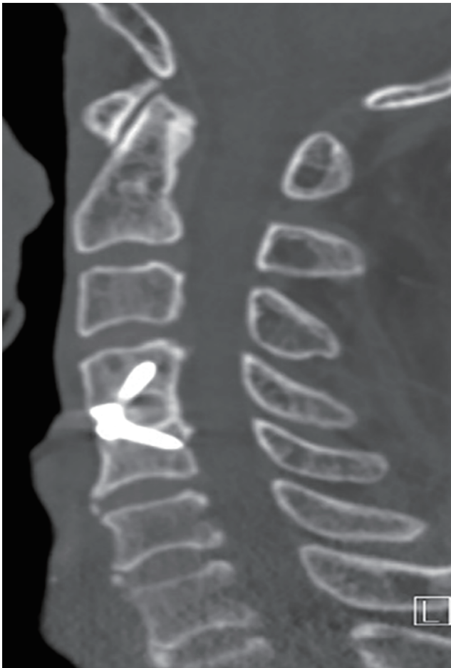
Fig. 3. Computed tomography showed additional new bone formation with bony bridging across the disc space.

Patient characteristics and clinical outcomes were assessed using descriptive analyses, with the mean (standard deviation) and median (interquartile range) presented for quantitative variables and the frequency (percent) presented for qualitative variables. The comparison of characteristics and clinical outcomes between groups A and B were analyzed using two-sample t-tests or Mann-Whitney U tests for quantitative variables and chi-square tests or Fisher's exact test for qualitative variables. p -values are presented for all statistically significant variables. All statistical analyses were performed using the SPSS software package for Windows version 19.0 (IBM, Chicago, IL, USA). All tests were 2-sided, and p -values <0.05 were