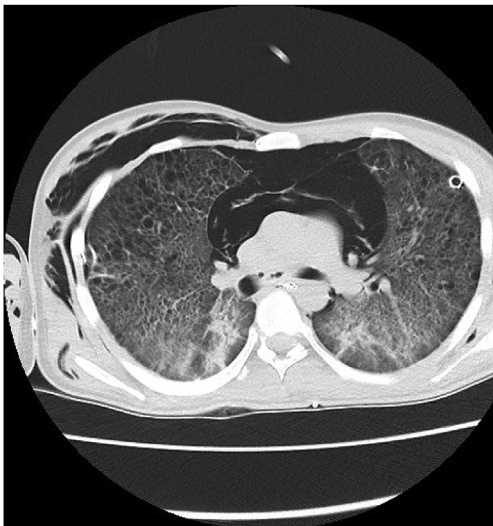
Fig. 2. A CT scan after 18 days in the ICU. The patient developed bilateral pneumothoraces, pneumopericardium and pneumomediastinum after a transbronchial biopsy. Bilateral pleural tubes in-situ.

confirmed (26 days after admission) when growth of Mycobacterium tuberculosis was detected in samples taken at admission. The bacteria grew in tracheal aspirate, urine and cerebrospinal fluid. Additionally, granulomas were seen in a bone marrow aspirate, liver and lung biopsies. The bacteria was found to be susceptible to all first-line anti-tuberculosis agents. The patient's dysphagia and mediastinal abscess were probably related to tuberculosis in the mediastinum. During the ECMO treatment the patient's lungs developed multiple bullae and he had persistent pneumothoraces where the lungs did not expand despite patent pleural tubes (Fig. 3).