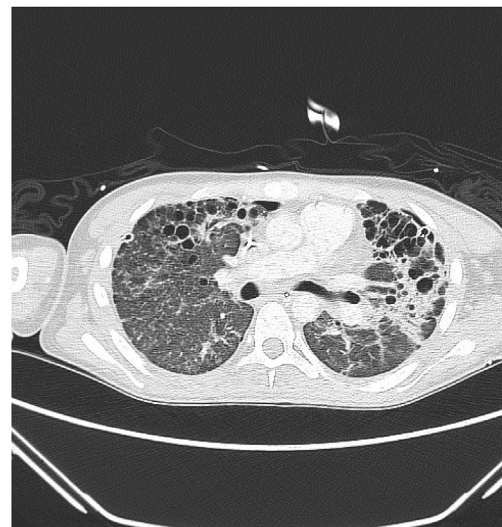
Fig. 4. A CT scan after 46 days on ECMO. Both lungs have expanded with functional lung tissue visible again. This correlated with improvement clinically.

amikacin , meropenem and ceftazidime/avibactam . As with the anti-tuberculosis agents, serum levels of amikacin were low.