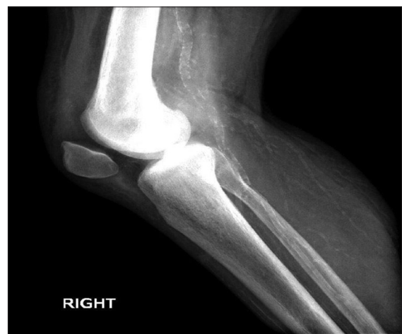
Figure 1: X-ray showing migration of patella due to quadriceps tendon rupture, case courtesy of http://radiopedia.org/ . From the case http://radiopedia.org/cases/11858

Bedside utility of US has become easier and less expensive than MRI. Quad tendon is 6–11 mm thick with linearly oriented