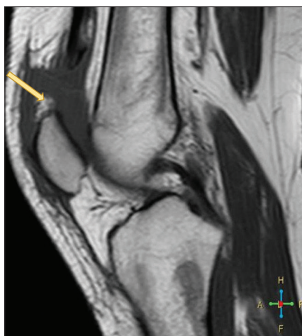
Figure 2: Magnetic resonance imaging of quadriceps tendon rupture. Yellow arrow pointing to the gap between the tendon and its insertion on the patella. http://radiopaedia.org/cases/quadriceps-tendon-rupture-3 . Case courtesy of Dr. Ahmed Abd Rabou, Radiopaedia.org, rID: 22644

MRI: Magnetic resonance image; US: Ultrasound