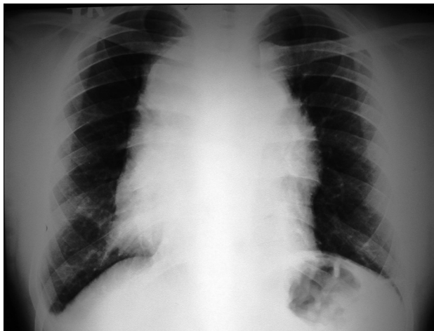
Figure 1: Chest X-ray of patient in arrival day

The SVC syndrome, occurs in approximately 15,000 persons in the United States each year. [2] If the syndrome occurs after the use of intravascular devices, diagnosis of the cause is straightforward. In other situations imaging