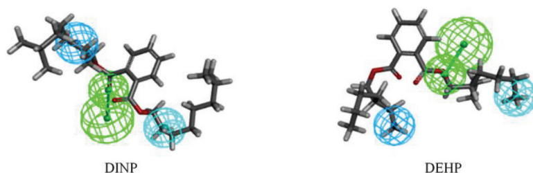
Figure 1. Hypo 1 pharmacophore model overlay with target molecules –DINP, DEHP.

Based on the negative logarithm of toxicity values (predicted by EPI Suite software) of 14 PAEs on multireceptors as data sources, the abovementioned PAEs' toxicity comprehensive effect pharmacophore model construction method was used to construct green algae, daphnia, mysid, and fish' single receptor optimal pharmacophore models, as shown in Table 10. The "configuration" values of the four pharmacophore models were 16.674 ( <17 ), while the "correlation" values were all greater than 0.7. This shows that the established pharmacophore model exhibits stable prediction ability.