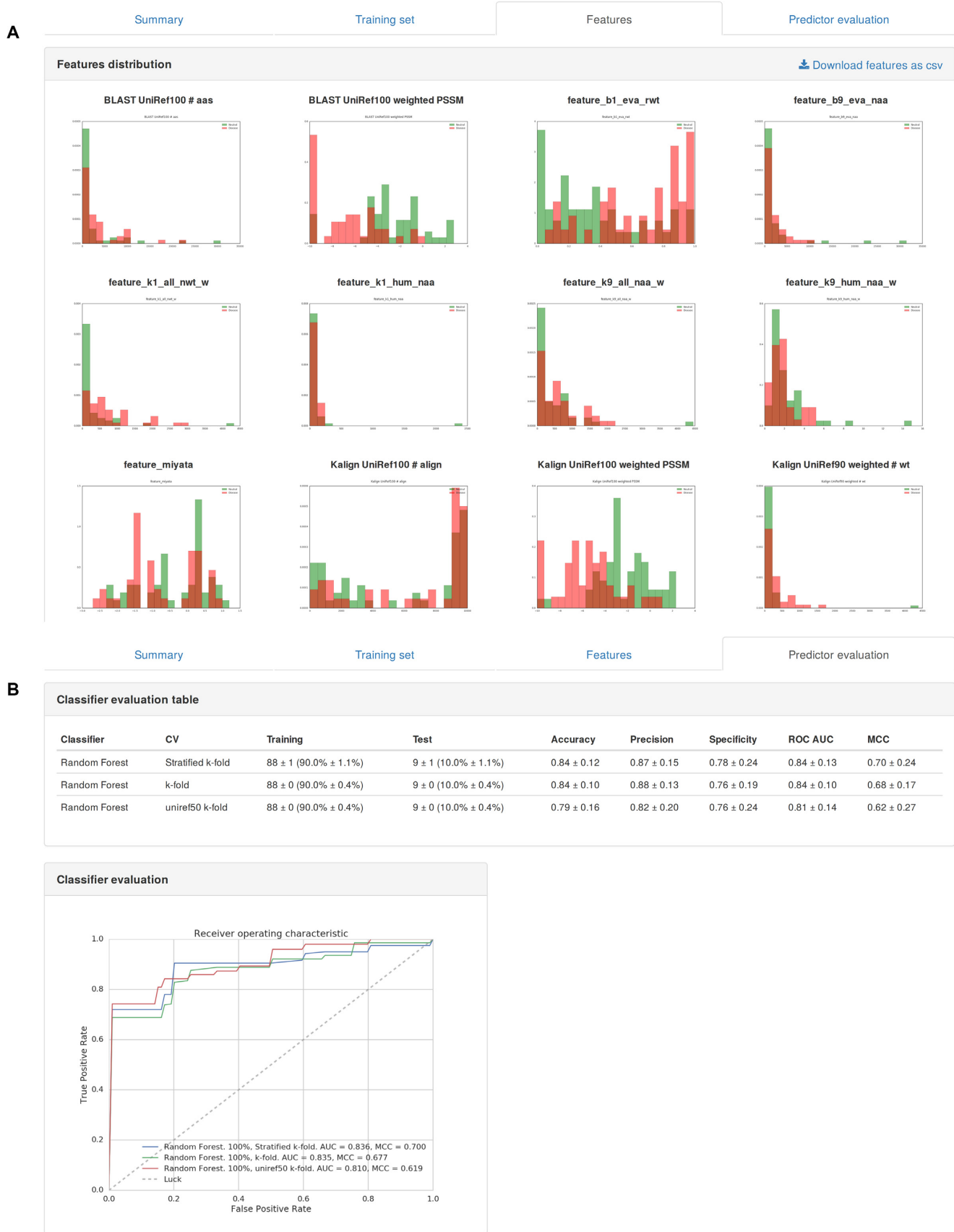
Figure 2. Partial screenshots of output of Predictor's training section. (A) Comparative plot of the selected protein features. (B) ROCs curves of performance evaluation.