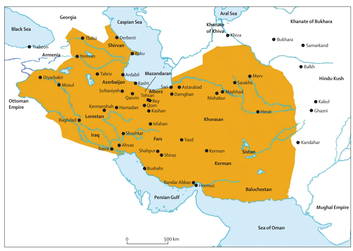
Figure 1: Map of Persia of around 1512 (reign of Shah Ismail I, founder of the Safavid dynasty)

Bahā' al-Dawlah's book, the Khulāsāt al-tajārib (The Summary of Experiences), which was completed in 1501 CE, is considered as one of the most coherent problem-based medical textbooks of its time.<sup>20</sup> This book consists of 28 chapters and contains clinical records of