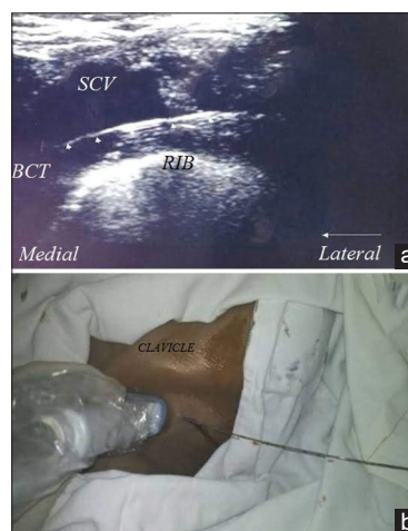
Figure 1: 2 D USG image of the guidewire (arrow) in supraclavicular SCV (a). Percutaneous puncture site for supraclavicular approach with the guidewire in situ (b).