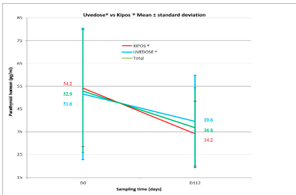
Figure 2. Serum PTH levels after administration of a single dose of 100,000 UI of vitamin D3.

A significant decrease in serum PTH levels was observed in both groups between Days 0 and 112 for Group 1 ( -20.0 \pm 22.8 ; p < 0.001 ) and Group 2 ( -12.0 \pm 23.3 ; p = 0.016 ) as shown in Figure 2. However, there was no statistical difference between the two groups ( p = 0.212 ).