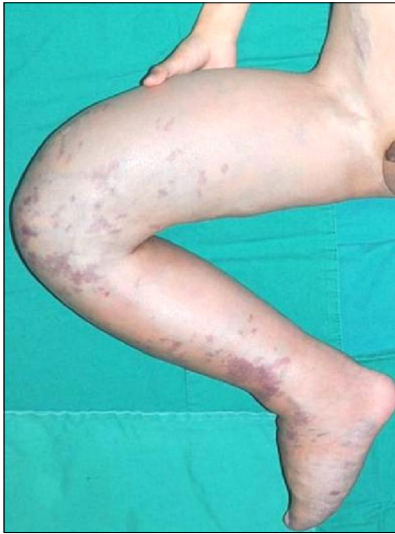
Fig. 1. Photo of arteriovenous malformation of right lower limb.

operative bleeding. For embolization, the radiologist performed catheterization through the left common femoral artery and installed a tourniquet over the right proximal thigh. Soon after, remarkable bradycardia developed due to a baroreceptor reflex-induced abrupt increase in the systemic vascular resistance (SVR), and this procedure was cancelled. After a thorough discussion with the plastic surgeons, orthopedic surgeons, and vascular surgeons, right hip disarticulation was considered to be the best option for improving the patient's quality of life. It was anticipated that the large feeding vessel branches of the right profunda femoris artery, superficial femoral artery, and the large veins draining the limb would be difficult to control during a hip disarticulation. To minimize the chances of torrential hemorrhage, a disarticulation was planned under cardiopulmonary bypass.