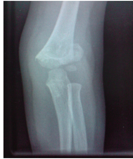
FIGURE 2: Preoperative AP radiograph.

injury to the ulnar nerve should be avoided but the construct may be biomechanically less stable [17–20].