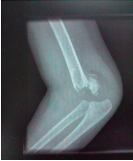
FIGURE 1: Preoperative lateral radiograph.