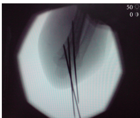
FIGURE 4: Intraoperative flexed AP Image.

factor), compared to the uninjured elbow [21]. The overall grading is based on the worst functional or cosmetic factor.