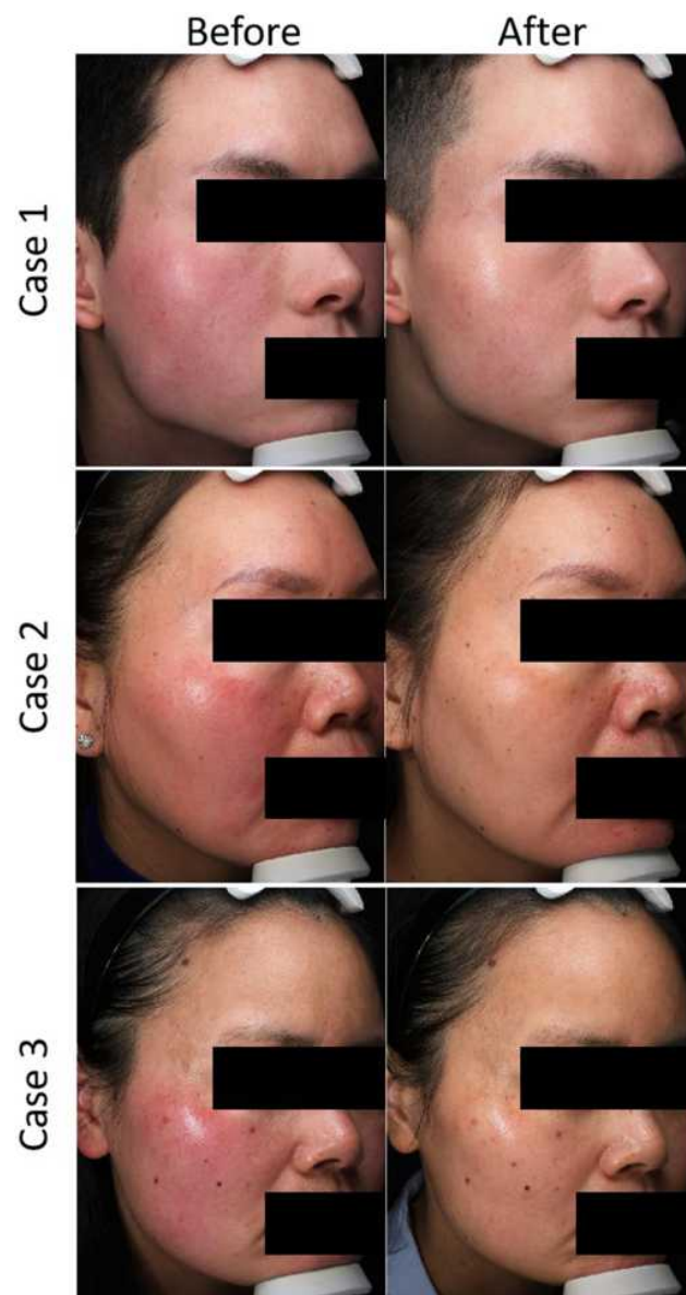
Figure 1 Contrast figures of three cases treated with BTX.

estimated according to the data from the 2019 Yearbook of Health Statistics of China and the 2019 Yearbook of labor Statistics of China. 20,21 All costs in this study are expressed in USD with an exchange rate of USD 1=CNY6.9785 (2019).