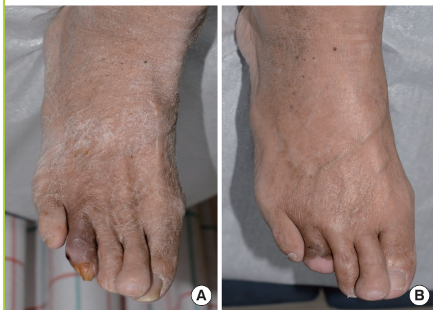
Fig. 7. Patient no. 5

In a 71-year-old male patient, a diabetic foot with chronic infection on the right fourth toe. (A) A preoperative photograph. (B) A photograph at a 2-month postoperative follow-up.