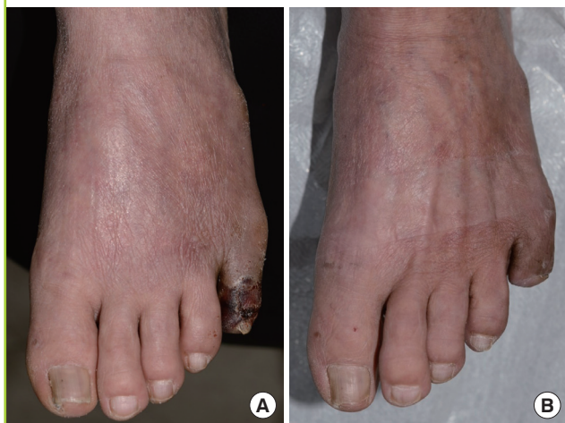
Fig. 6. Patient no. 4

In a 65-year-old male patient, a diabetic foot with chronic infection on the left fifth toe. (A) A preoperative photograph. (B) A photograph at a 1-month postoperative follow-up.