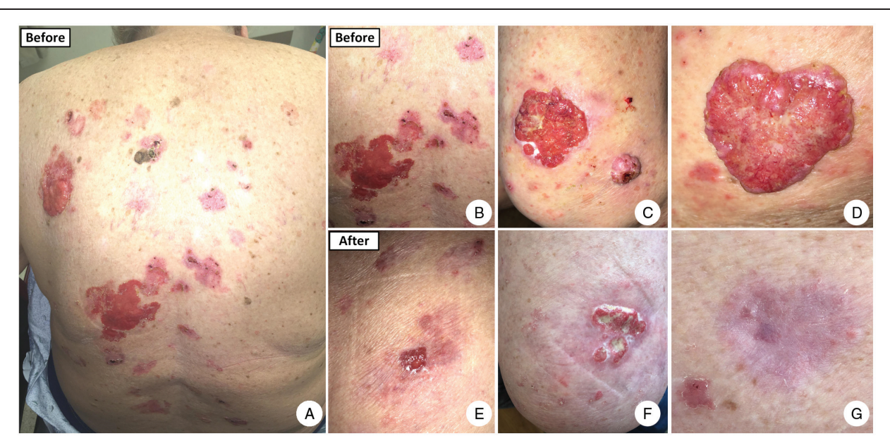
Figure 1. Clinical presentation of the patient with numerous basal cell carcinomas before and after treatment with nivolumab. A–D: There are numerous large, exophytic, and ulcerating BCCs involving mainly non-sun exposed areas of the skin (A), including mid and lower back (B), bilateral thighs (C), and buttock (D), as well as sun-exposed areas including lower legs, forearms, and hands (not shown). Head and neck including face were largely spared. E–G: Almost all large and ulcerating tumors have regressed mostly or completely after treatment with nivolumab. There are few small and thin residual lesions that are gradually resolving after treatment.

diagnosis of BCC as the underlying malignancy (Fig. 2), while only one lesion showed squamous cell carcinoma. On careful examination, no other skin findings, such as palmar pits, suggestive of Gorlin syndrome, were noted.