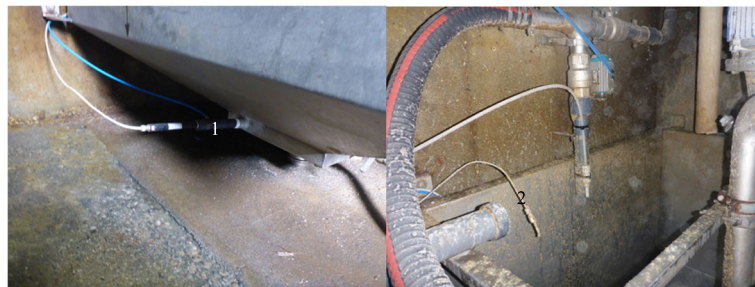
Fig. 3 Technical device to measure pH-value in the liquid feed. A pH-value probe (1) permanently measures the pH-value of the feed soup in the mixing vat. An automatic addition of acid from a dosing feeder (2) ensures a constant pH-value in the liquid feed

In the present case, the farmer was using antimicrobials as prophylaxis to ensure that another outbreak of dysentery after the partial sanitation did not occur. However, this is not in line with the good standards of antimicrobial use and is counterproductive regarding the aspired reduction of antimicrobials and antimicrobial resistance. Several studies show that even a low, short-term dose of in-feed antimicrobials increases the abundance and diversity of antimicrobial resistance genes, including resistance to antimicrobials not administered [12, 13]. In addition, antimicrobial introduced to the feed provokes a selective pressure that may lead to long lasting changes in livestock commensal microorganisms [14, 15] helping pathogens to multiply in the gastrointestinal tract. This antimicrobial