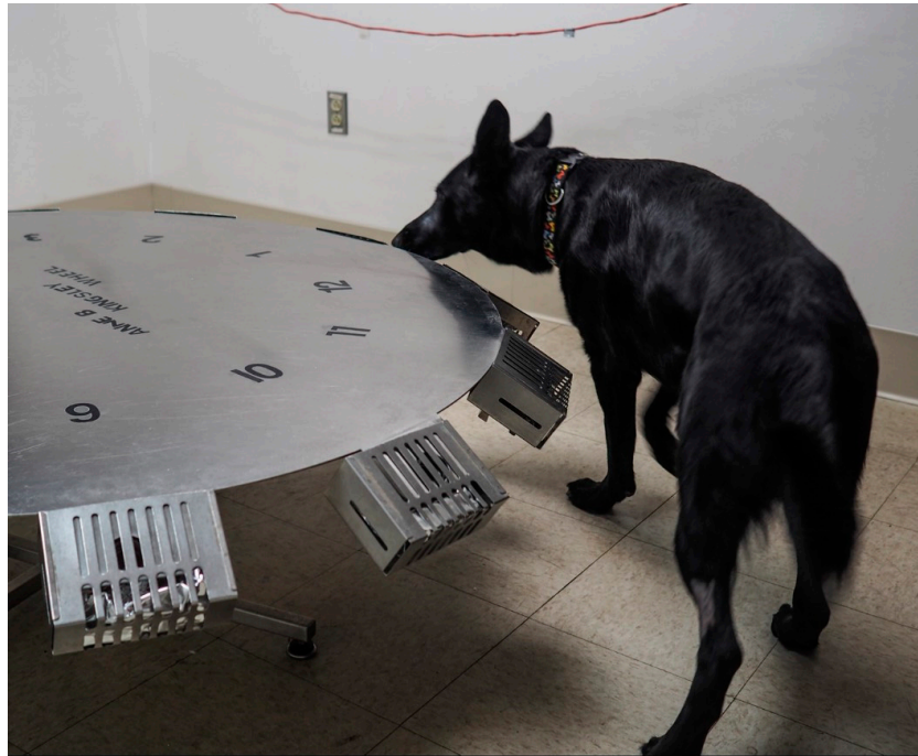
Figure 1. A dog searches the scent wheel—each port was numbered between 1 and 12 and held a different odor. These ports were then covered with metal grates to ensure the dogs could not come into contact with the odors.

was able to watch the dog work through a video connection into the wheel room in order to avoid influencing the search. Only one trial was carried out at each time point, where the dog was sent in and worked until they found the odor. When dogs successfully alerted on the UDC (Figure 2), the behavior would be marked with a click by the trainer (blind to the dog's treatment status) and the dogs would come out of the wheel room to receive a reward, either a toy or a food reward depending on the dog's preference.