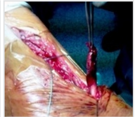
Figure 3: Photograph of the exposed central stub of the tendon after the placement of the bone anchor in the first sphenoid bone.

extent due to the contraction of the toe extensors, but heel walking on the right foot was impossible. Dorsiflexion with the foot in inversion was also impossible.