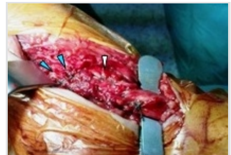
Figure 5: Completion of the suturing of the tendon, the blue arrows show the bone anchors and the white arrow points to the suturing of the periosteum.