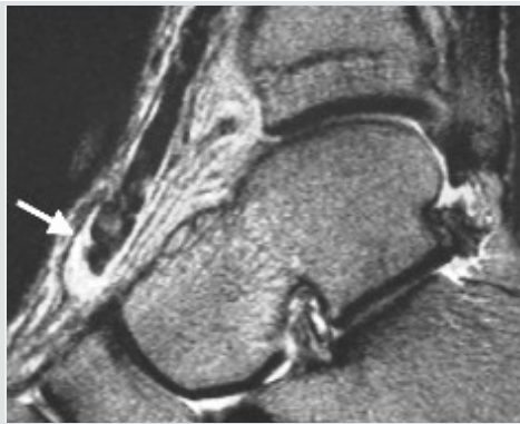
Figure 1: Magnetic resonance imaging scan of the patient's ankle joint. The proximal stub of the anterior tibial tendon can be seen (white arrow).