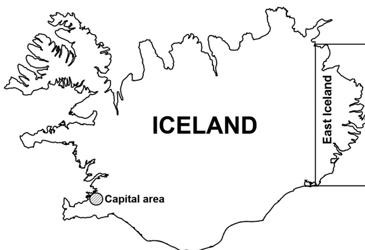
Figure 1. Map of Iceland: Box illustrates East Iceland, where the study was conducted; circle demarcates the capital area.

The data for this study were from the Resident Assessment Instrument Minimum Data Set 2.0 instrument (interRAI-MDS 2.0), designed for use in nursing homes. Since 1996, it has been mandatory for Icelandic NHs to assess residents with the interRAI-MDS 2.0 instrument at admission and since 2003 at least three times a year. Results from interRAI-MDS 2.0 are used as a basis for nursing home reimbursement [18]. The interRAI-MDS 2.0 assessment used in our study was the newest assessment for each resident over the research period 2016–2018.