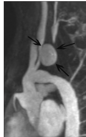
Figure 1: Contrast-enhanced magnetic resonance angiography showing a large, saccular (pseudo) aneurysm (arrows) of the proximal, left common carotid artery

The standard treatment of extracranial carotid aneurysms and pseudoaneurysms is surgical resection, which is associated with good long-term patency rates of the treated vessels. [1] However, to avoid thoracotomy,