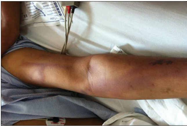
Figure 1: Extensive thrombophlebitis in the left forearm and arm

to maintain Oxygen saturation SpO_2 above 92%. He was also given other supportive therapy in the form of intravenous Pantoprazole as stress ulcer prophylaxis and Ondansetron. After 2 h in the ICU, he had improvement in blood pressure, normalization of serum lactate level (2.3 mmol/L) and sensorium. He confessed to the self-injection of intravenous phenol. He also revealed that he tried to consume "All Out" liquid (Mosquito repellent containing 1.6% Pyrethrin) but immediately vomited out. At this time, he was oliguric and progressively more tachypneic with worsening oxygenation status. Chest X-ray showed bilateral patchy infiltrate [Figure 2]. Initial laboratory investigations revealed normal complete blood count; high blood urea nitrogen (21.1 mg/dl) and S Creatinine 2 mg/dl with normal electrolytes; deranged liver function test (S Bilirubin 3.02 mg/dl, direct Bilirubin 0.14 mg/dl, aspartate aminotransferase AST 211 U/L, alanine aminotransferase ALT 95 U/L, alkaline phosphate ALP 95 U/L, lactate dehydrogenase LDH 2574 U/L); normal serum Amylase; deranged coagulation parameters partial thromboplastin time 63.7 min, control 26 min and prothrombin time 27.8 min, control 12.4 min); high creatine phosphokinase (447 U/L). Urine analysis showed hemoglobinuria and proteinuria 3+. After an initial trial of noninvasive ventilation for half an hour, he was intubated and started on mechanical ventilation support with low tidal volume strategy.