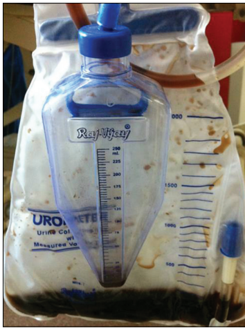
Figure 3: Dark urine

Presence of hypoxia at admission and initial chest X-ray showing bilateral infiltrate strongly favors the diagnosis of ARDS in our patient. Normal caliber of the inferior vena cava with significant respiratory variation on admission makes fluid overload unlikely. Acute respiratory failure and acute kidney injury following inadvertent injection of higher concentration of phenol (89% instead of 6% of 10 cc phenol) for chronic pain relief was described in a case report. [4] The authors have also described evidence of hemolysis, high creatine phosphokinase value and lactic acidosis in the patient.