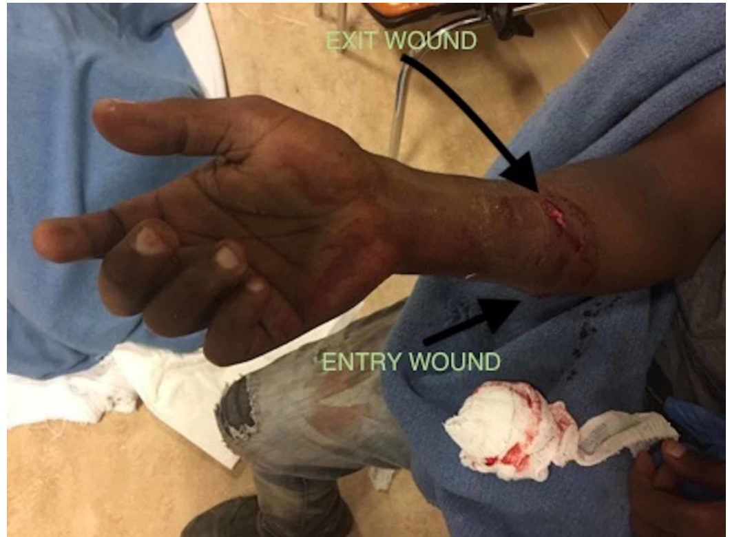
FIGURE 1: Gunshot wound on the right forearm

A 28-year-old male patient presented to our emergency department after sustaining a gunshot wound to the right forearm. The entry wound was located on the ulnar-dorsal aspect of his right mid-forearm. The exit wound was located on the volar aspect of the forearm and 3 cm distally to the elbow (Figure 1). Examination revealed absent sensation on his right 5th and ulnar half of the 4th fingers. The metacarpophalangeal joints of his 4th and 5th fingers were extended and the interphalangeal joints of the same fingers were flexed, suggestive of a 'claw'. Froment's test was positive.