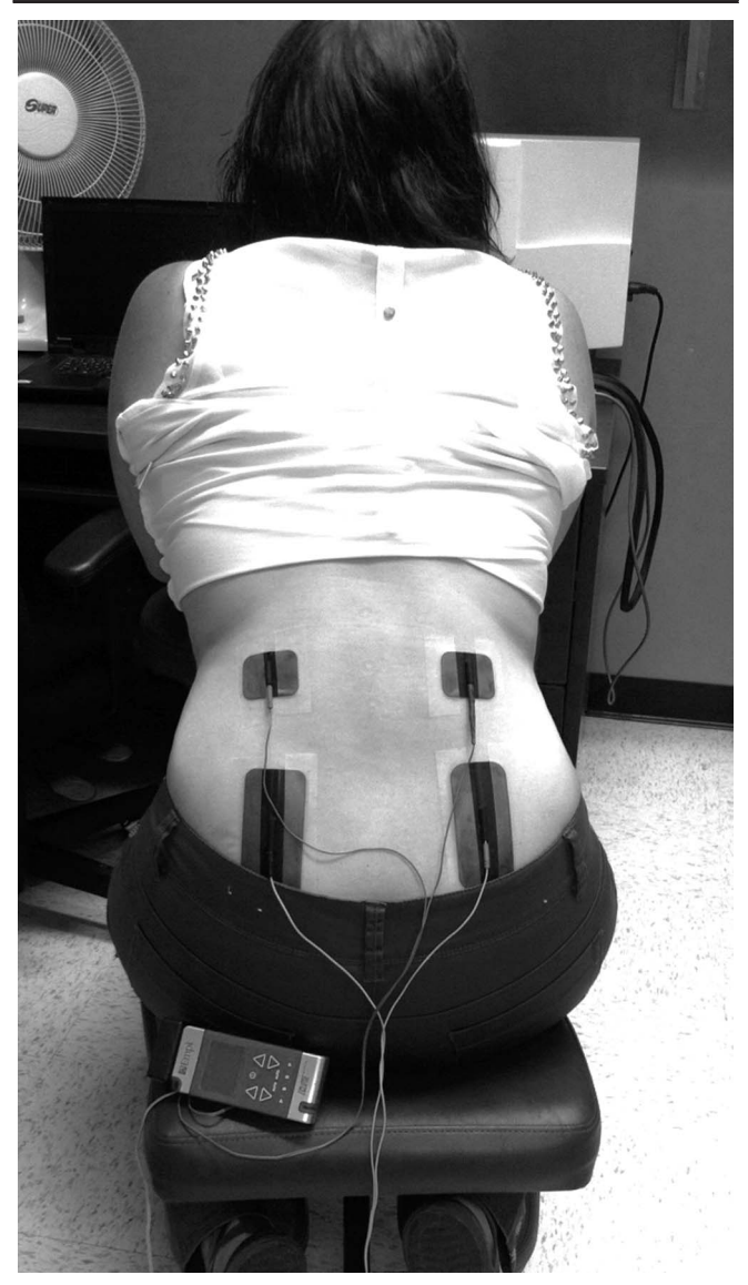
Figure 1. Transcutaneous electrical nerve stimulation application.

Participants were seated comfortably in a massage chair (Fig. 1). A pretesting session was first conducted to familiarize participants with the computerized visual analog scale (CoVAS; Medoc, Advanced Medical Systems, Minneapolis, MN) and to determine the temperature that would be used during the 2-minute tonic heat pain test. This pretest was performed with a 10-cm<sup>2</sup> Peltier-type thermode (Medoc, Advanced Medical Systems) applied to the thoracic region. Participants were advised that the thermode temperature would gradually rise from 32^{\circ} C to 51^{\circ} C (rising rate = 0.3^{\circ} C/s). During the first pretest, subjects verbally reported their pain perception threshold and pain tolerance threshold. On the second pretest, subjects were given the CoVAS and advised that they would have to start moving the cursor towards the right (towards the "100" mark) when they would start to feel pain (pain perception threshold) and that the cursor would need to be at the extreme right (at the "100" mark) when pain was intolerable (pain tolerance threshold). This procedure was repeated until the subject's pain reports were consistent between trials. The temperature used during the following experimental heat pain test was determined by selecting the temperature for which the subject had rated the