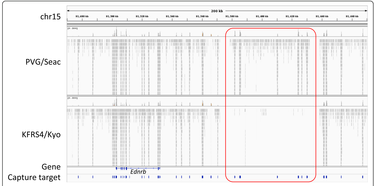
Fig. 2 A deletion found upstream of Ednrb in KFRS4/Kyo. This plot was created using Integrative Genomics Viewer [24]. The genomic interval of chr15:91,470,000–91,670,000 is shown. The upper track shows the mapped reads obtained from the control PVG/Seac strain, and the lower track shows the mapped reads obtained from the KFRS4/Kyo strain. The gene track and the track for the capture target regions are indicated below the tracks of the mapped reads. The deletion found in KFRS4/Kyo is indicated by a red rectangle

about the genome-wide distribution of enhancer-specific histone modifications, namely, H3K4me1 and H3K27ac, and transcription factor binding sites identified as DNase I hypersensitive sites [14] in various cell types, especially in human. To compare epigenomic profiles between different species, we converted the genomic coordinates of the deletion in rats to the corresponding coordinates in human, and analyzed the epigenetic data for that region. It is shown that the epigenomic features are, to some extent, conserved among different species [27], so it is reasonable to make use of the epigenomic data obtained for other species in which substantial data are available. We used the LiftOver function in the UCSC Genome Browser for this conversion of the genomic coordinates [28].