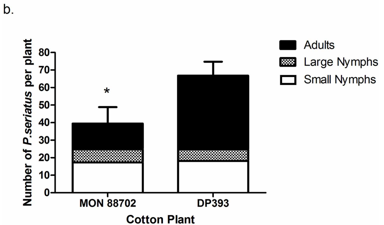
Fig 1. Numbers and stage of next generation (a) L. lineolaris and (b) P. seriatus recovered from MON 88702 cotton expressing Cry51Aa2.834_16 protein in whole plant caging experiments. Standard error bars are for total numbers of next generation insects. *indicates a significant difference ( \alpha = 0.05 ) between MON 88702 and DP393 (non-transgenic near-isoline).