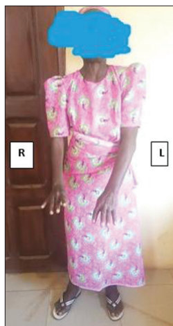
Figure 1: Right hemibody atrophy

neurodevelopmental anomalies. [6] It can also be discovered incidentally while evaluating patients for unrelated pathologies. [7] The clinical features of schizencephaly vary from hemiparesis to seizure disorder. [8] The age at presentation is usually before the age of 10 years. [9] Seizure disorders have been reported as the most common presentation in patients with schizencephaly and it usually begins before the age of 3 years. [10] Our patient presented with focal seizures evolving to bilateral tonic-clonic convulsions, with onset at the age of 58 years, though she has had mild right hemiparesis and atrophy [4] which could have explained her left handedness.