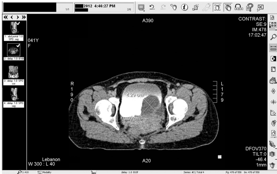
Figure 2 A bladder leiomyoma on CT of the abdomen and pelvis with intravenous contrast medium, showing a well-delineated endovesical bladder tumour, 6 cm × 4.2 cm, arising from the left posterolateral bladder wall.