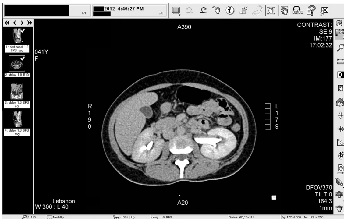
Figure 5 Enhanced CT of the abdomen and pelvis showing left hydronephrosis and a left 'extra-renal' pelvis, due to the bladder leiomyoma obstructing the left ureteric orifice.