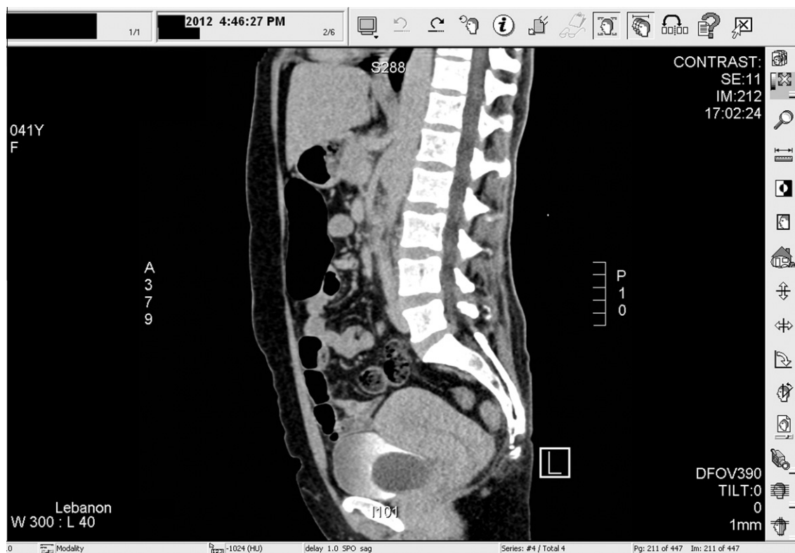
Fig. 4 A bladder leiomyoma on CT of the abdomen and pelvis with intravenous contrast medium (sagittal view), showing an endovesical bladder tumour.