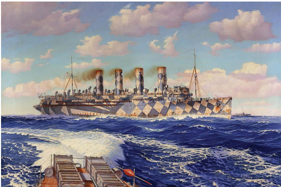
Figure 2. The blue and black ship? Admiralty diagrams (not shown) indicate that the official scheme was blue, black, and gray. (This image is public domain.)

importantly, I have found no evidence (photographic, eyewitness reports, or reference to Admiralty records) that Mauritania ever carried different coloration in any of the pale diamonds on the fore of the hull. Builders of scale models have a tenacious interest in the subject of livery/camouflage, and Internet posts from them come to similar conclusions. Nonetheless, an alternative scheme is readily found in reference books (Williams, 1989 , 2001 ), paintings, (including one by Crossley) and Internet