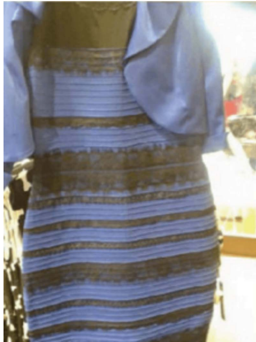
Figure 1. The blue and black dress that introduced the public to the fact that perception of color is not just about “reading” the RGB of each pixel. (This image is assumed to be public domain.)

importantly, I have found no evidence (photographic, eyewitness reports, or reference to Admiralty records) that Mauritania ever carried different coloration in any of the pale diamonds on the fore of the hull. Builders of scale models have a tenacious interest in the subject of livery/camouflage, and Internet posts from them come to similar conclusions. Nonetheless, an alternative scheme is readily found in reference books (Williams, 1989 , 2001 ), paintings, (including one by Crossley) and Internet