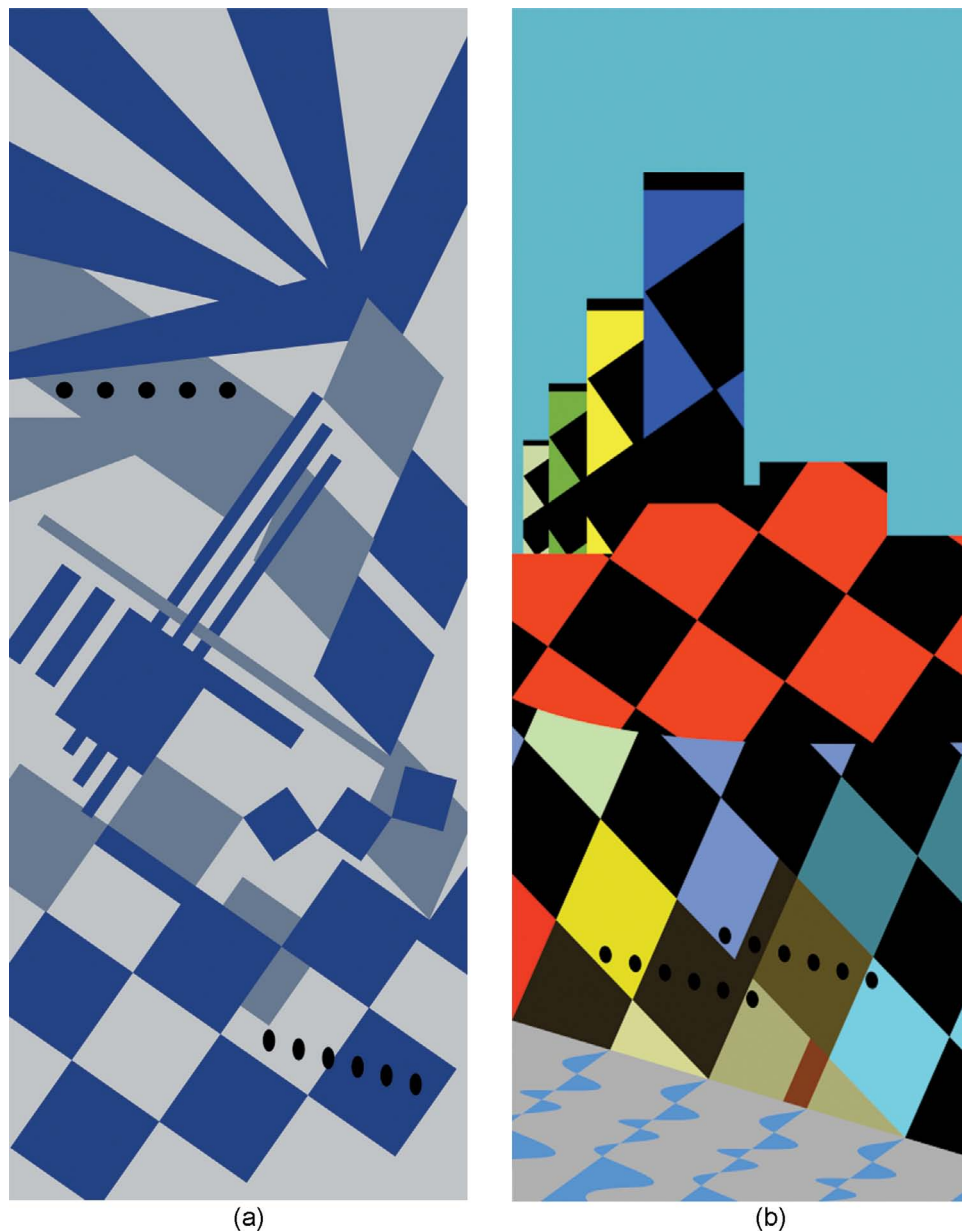
Figure 4. The door to misperception: Abstract expressionist artwork (2011) inspired by the dazzle camouflage of RMS Mauritania, printed on each side of a domestic internal door. (a) An image inspired by (i) the different dazzle patterns found on the two sides of the ship, (ii) the painting by Burnett Poole (Figure 2), and (iii) a model constructed by Jim Baumann (not shown). (b) The “sunset” colors were inspired by those found in the Cunard Line publicity poster (Figure 3a) in an image that also pays homage to the cubist art period of the time (note the orthogonal directions of travel implicit in the superstructure). (Copyright held by the author/artist.)