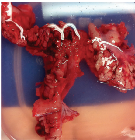
FIGURE 3: Pathological specimen of porcine pancreas (on the 6th day after procedure, the pigs were euthanized. The pancreas of the pigs was immediately excised surgically for gross examination of damage and tissue response) (reproduced from an open access article under terms of the Creative Commons Attribution License [4]).

probe (CTP) combined bipolar RF ablation with cryotechnology. A bipolar system ablates with less collateral thermal damage than a monopolar system but with less efficiency overall. The cryotechnology in this probe is used both to combine the advantages of the two approaches and to overcome the disadvantage of less efficiency: the more effective cooling by cryogenic gas increases the RF-induced effects [7]. Studies not using the Habib EUS-RFA or ERBE utilized the VIVA RF generator (STARmed, Koyang, Korea). This device utilized an 18 G FNA needle to introduce the catheter but otherwise had a similar approach to the Habib EUS-RFA catheter.