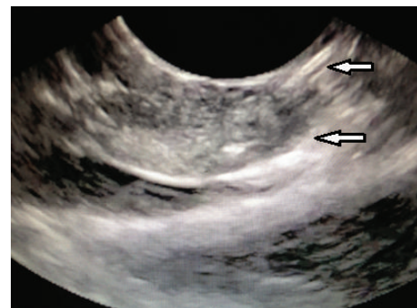
FIGURE 2: Endoscopic ultrasound view showing EUS-RFA probe inserted into the porcine pancreas (the porcine pancreatic tissue was ablated with RFA after placing EUS-guided 19-gauge Wilson Cook needle into the pancreas via transduodenal approach) (reproduced from an open access article under terms of the Creative Commons Attribution License [4]).

Ltd., London] was placed through a 19-gauge or 22-gauge fine needle aspiration (FNA) needle. The Habib EUS-RFA is a 1 Fr wire that can be inserted through the biopsy channel of an echoendoscope (Figure 1). To coagulate tissue in the pancreas, RF power is applied to the electrode at the end of the wire. Though our studies focused on EUS-RFA in the pancreas, the same modality could also be used in the liver. The Habib EUS-RFA is a monopolar device and is used in conjunction with a patient grounding/diathermy pad. This novel system comes in dispensing sheath and the catheter is removed from the dispensing sheath and connected to the adaptor cable, which is then connected to the generator. Power in the generator is set to the required wattage and a patient grounding/diathermy pad is applied as close to the operating field as possible, since the catheter is monopolar. Once the catheter is placed through EUS control and by using a 19-gauge biopsy needle with a stylet, RF energy is then applied for 90–120 s in most cases at the set wattage (Figure 2). In larger lesions, the Habib EUS-RFA probe and needle are pulled back as one unit and repositioned to ablate the lesion. This process can be repeated as many times as needed to ensure complete ablation of the lesion [12–14].