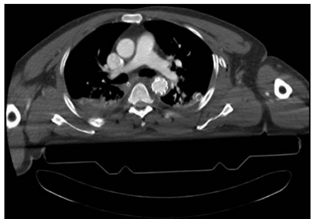
Fig. 2 Follow-up computed tomography angiogram after endovascular repair for blunt thoracic aortic injury.

All survivors returned to ICU. Following cardiovascular stabilization, patients were either discharged home or referred to other facilities for treatment of their concomitant injuries. Patients who underwent TEVAR were followed up with CTA at 1, 6, and 12 months after procedure (→ Fig. 2). Long-term follow-up was performed via data from follow-up visits and phone calls.