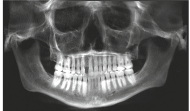
FIGURE 1: Reconstructed panoramic image.

On examination, missing right maxillary lateral incisor and third molars were noted (Figure 1). A full field of view cone-beam computed tomography (CBCT) analysis was performed to assess the prospective implant site. The axial slice CBCT images revealed a huge mass with a polypoid shape and soft density that occupied the right ethmoid sinus and sphenoid sinus (Figure 2(a)) [5]. There was a noteworthy enlargement or bulging of the lateral and the medial wall of the right ethmoid sinus. Due to the infiltration or penetration of the lesion to the sphenoid sinus, focal bone erosion of the sphenoid sinus floor was suspected on the sagittal section CBCT images (Figure 2(c)). In addition, this lesion also had progressed into the region of the nose and right maxillary sinus (Figure 2(b)). A significant deviation of the nasal septum was observed. The coronal CBCT images of the right maxillary sinus portrayed significant soft tissue opacification/mucosal thickening involving up to the superior confines of the sinus. In addition, displacement of the inferior medial wall of the right orbit was speculated with no evidence of erosion. There was complete obstruction of the osteomeatal complex on the right side. The middle concha was displaced and was entirely obliterated by the lesion; variation in size of inferior concha was observed as well (Figure 2(b)).