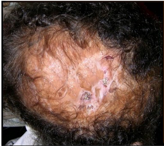
Fig. 1 Atrophic scarring of the vertex, representing aplasia cutis congenita [2]

Combined with the common association of cardiac and vascular abnormalities in AOS, it is hypothesized that the spectrum of defects observed in AOS could be due to a disorder of vasculogenesis [6]. So far, the disease-causing genetic defect in AOS has not been definitively identified. We present a case illustrating the