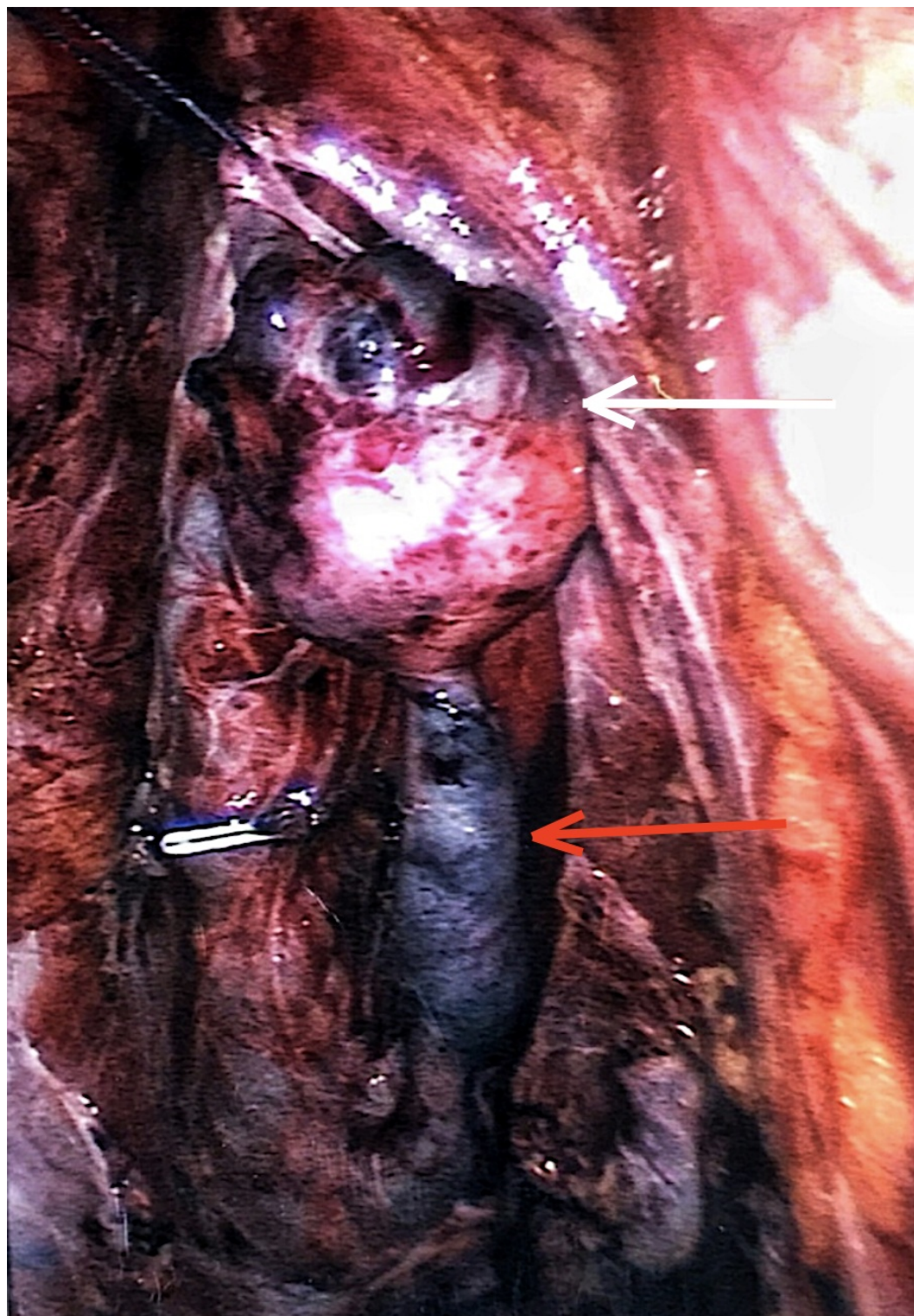
FIGURE 2: Right retroperitoneal mass

Intraoperative finding of right retroperitoneal firm mass (white arrow), measuring 1.5 cm in greatest dimension with attached rubbery tail-like tissue (red arrow)