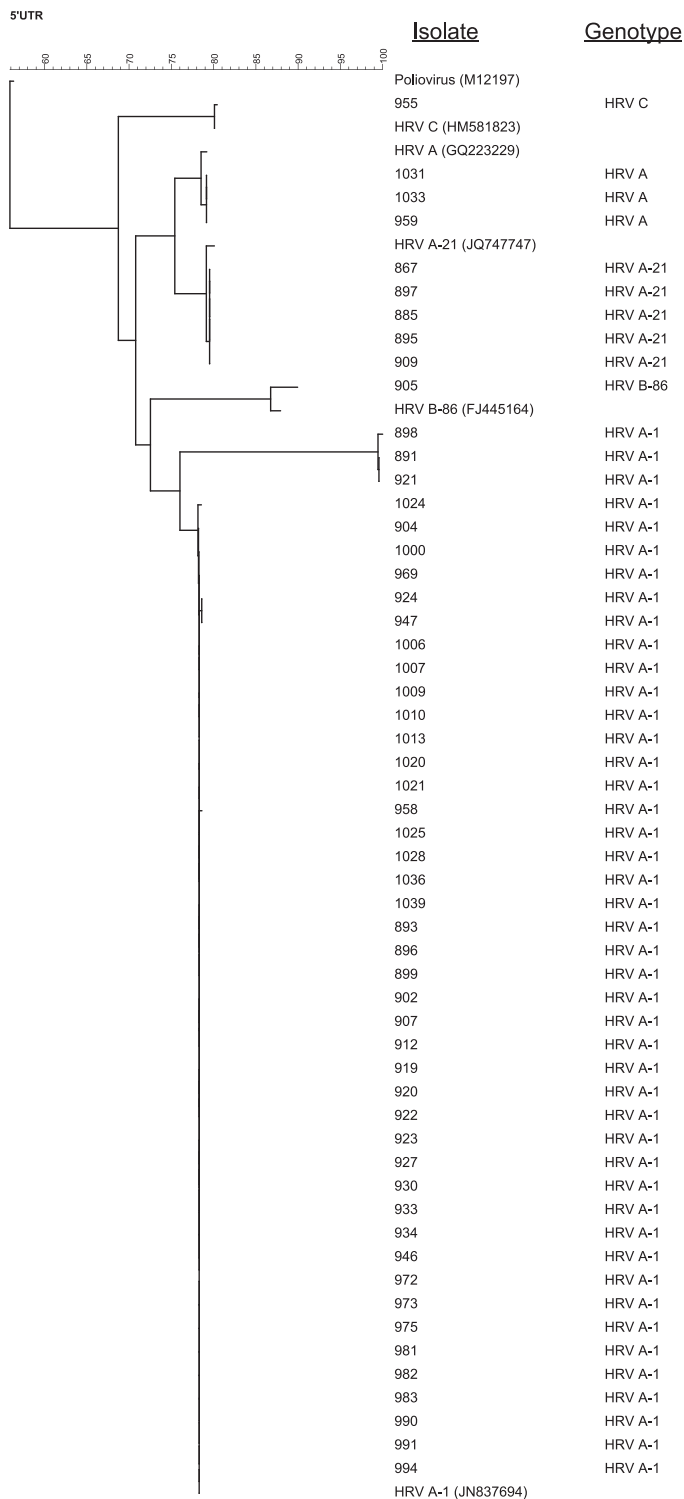
Fig. 2. Dendrogram of HRV 5' UTR partial sequence analysis using the neighbor-joining method. Poliovirus (GenBank M12197) was used as the out-group.

outbreaks reported in the literature [6,8,32]. Among household members, multiple types of HRVs have been shown to co-circulate simultaneously [30]. This is the first study we are aware of where multiple HRV genotypes have been implicated in a LTCH outbreak. VP1 region sequencing provided better resolution and was able to genotype 3 HRVs which were only identified to the species level by 5' UTR sequencing. Recombination cannot be ruled out in the case of the type identified as a species B by 5' UTR analysis without