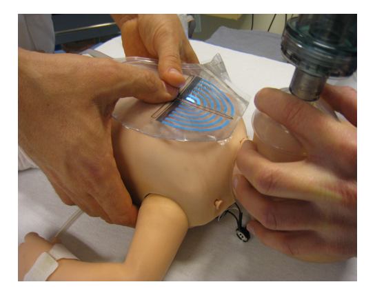
Figure 2. The ROLA design placed over the thorax of a newborn mannequin. The design features clear recognizable marks to be placed over sternum and inter nipple line in order to position the point of chest compressions exactly in the middle of the lower sternum. The effectiveness of external chest compression was measured with a visual indicator that lighted up with increasing pressure. The indicator was calibrated in such a way that compression of the chest up to one third of the diameter of the chest resulted in lighting of five electroluminescent strips.

Statistical analysis: the data are expressed as mean \pm standard deviation. The Wilcoxon signed rank test was applied to test differences between the first and second CPR session within the groups. The Mann-Whitney U test was