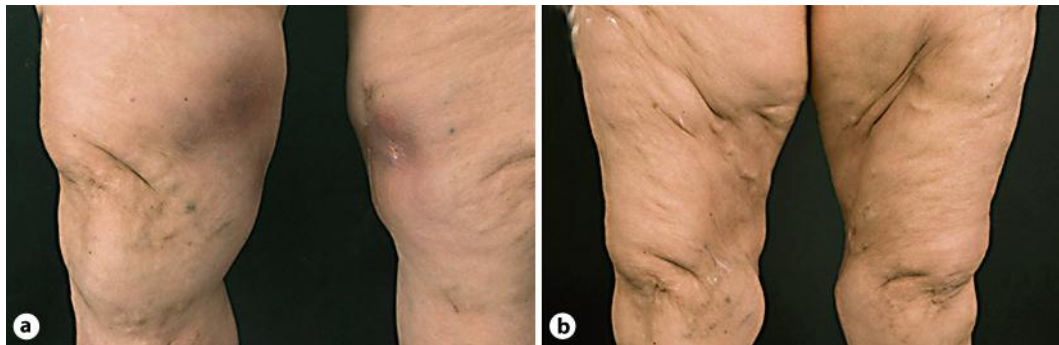
Fig. 1. a On admission painful erythematous plaques were observed on the upper medial thighs bilaterally. b After seven months of treatment with bexarotene and prednisone, infiltration and reddening of the skin were no longer present, leaving atrophy of the subcutaneous tissue.