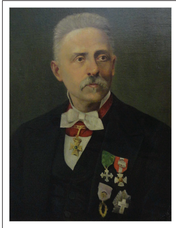
Figure 1. Reproduction of an oil painting of Ragona-Scinà (Chinnici, 2013).

with multi-field tachistoscopes. These were popular in vision research from about 1910 to about the 1970s when they were largely supplanted by oscilloscopes and then computer monitors (Wade & Heller, 1997).