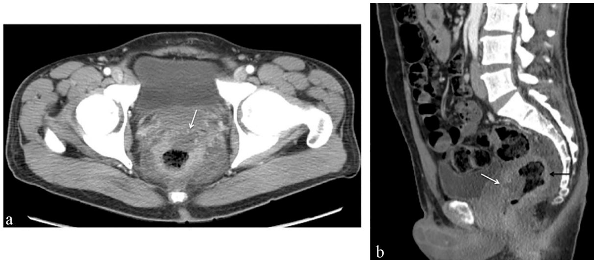
Fig. 2. Axial image from contrast-enhanced CT scan 11 days later (a) shows decrease in mural thickening and anterior hypoattenuated ulcer. Sagittal image (b) shows decrease in enhancing posterior rectal wall (black arrow) and large anterior wall hypoattenuated ulcer (white arrow) compared with prior exam. Pelvic ascites resolved (not shown).

Conceptualization, Writing- Reviewing and Editing.