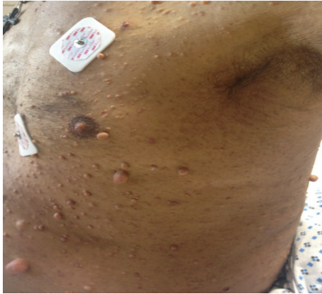
FIGURE 2: Subcutaneous neurofibromas and axillary freckling as noted in the patient at the time of admission.

consistent with the subcutaneous fibromas of NF1 (Figure 2). CA 19-9 was elevated at 200 u/mL (reference range, less than 34 u/mL) but carcinoembryonic antigen (CEA) was within normal range.