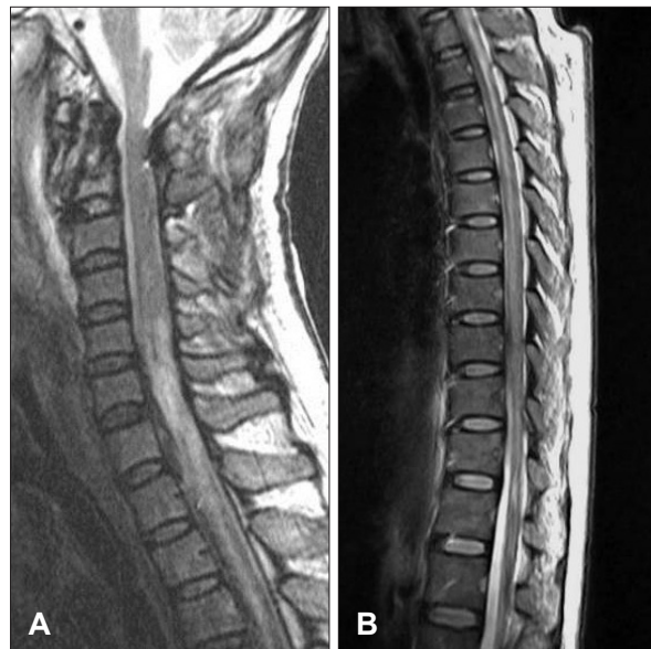
FIGURE 4. Cervical MRI revealing heterogeneous high signal intensity (consider to hemorrhagic contusion) in spinal cord of C3–T2 level (A) and extensive syringomyelia in thoracic spinal cord (B).