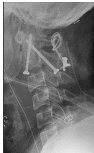
FIGURE 3. Postoperative lateral cervical radiography revealing anterior transodontoid screw fixation and unilateral C1–2 posterior transarticular screw fixation with wiring achieved reduction of odontoid fracture.